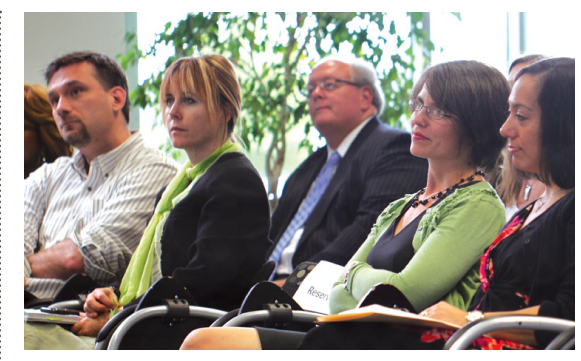
Senior leaders discuss digital innovation with employees at a LEAD event.

To succeed in the knowledge industry, we need smart, informed, diverse and committed employees who can meet our customers' evolving needs. Their talents enable us to deliver high quality products and services and maintain our leadership positions in financial and education markets.